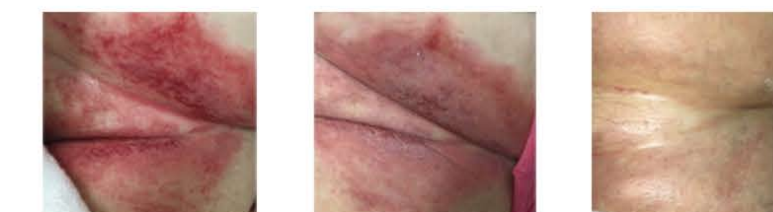
Day one 6 Hours 6 Days

"I can especially think of one patient... who was really badly excoriated and when you'd touch them they would cry. After two days of the cloths they said, "Oh, that is so much better". (Focus group 2)